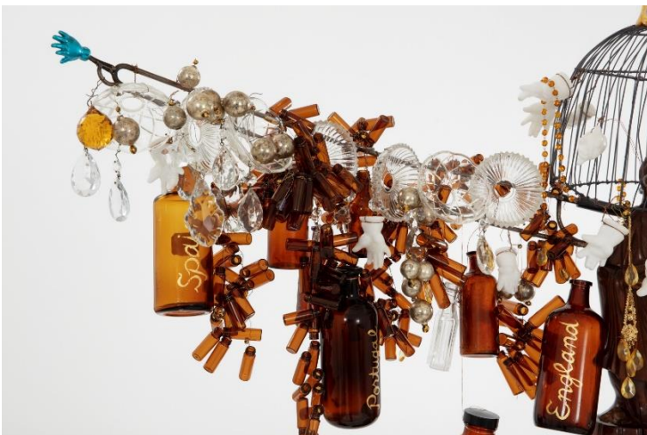
Rina Banerjee, Lady of Commerce —wooden

COST: $109; $99 for members. Train ticket, museum tour and lunch are included.