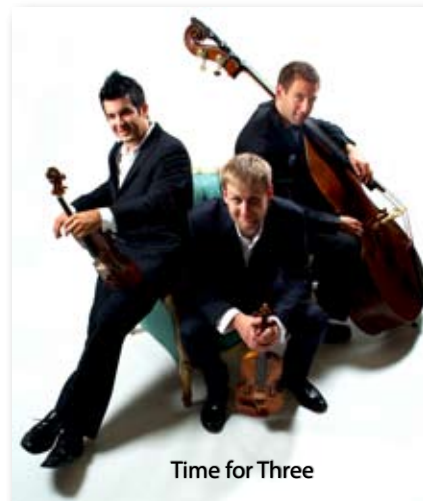
Time for Three