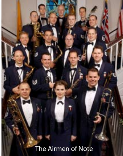
The Airmen of Note