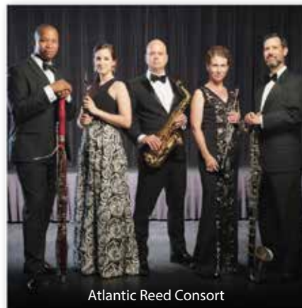
Atlantic Reed Consort

The Shepherd Jazz Festival will conclude with an evening concert featuring the United States Navy Band Commodores at 7:30 pm in the Frank Center Theater . The performance will