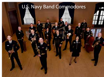
U.S. Navy Band Commodores

Formed in 1969, U.S. Navy Band Commodores, the Navy's premier jazz ensemble, have been performing the very best of big band jazz for the Navy and the nation for over 40 years. The 18-member group continues the jazz big band legacy with some of the finest musicians in the world.