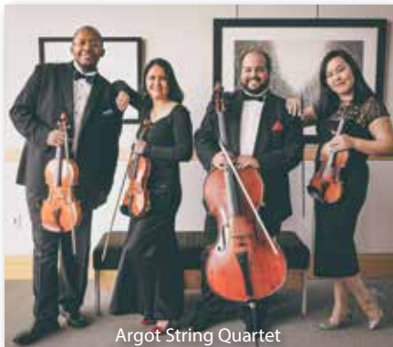
Argot String Quartet