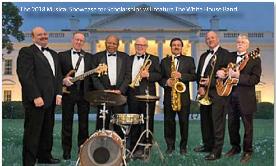
The 2018 Musical Showcase for Scholarships will feature The White House Band

If you are interested in supporting our 2018 Musical Showcase for Scholarships event and Shepherd University's Music Department, you can contribute through the Shepherd University Foundation, http://shepherduniversityfoundation.org .