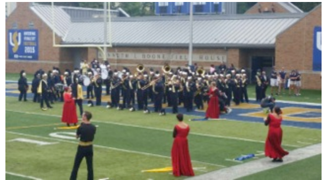
Pregame Stadium Jam 2016

The Shepherd University RAM Band will perform “feel good” music to celebrate the arrival of our new band uniforms. Music selections include: “Rock This Town” by Brian Setzer, “Can’t Stop The Feeling” by Justin Timberlake, “Hallelujah” by the Pentatonix, “Let The Good Times Roll” by Ray Charles and “Signed, Sealed, Delivered” by Stevie Wonder!