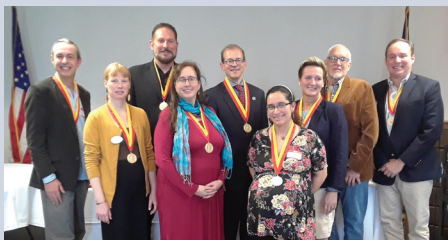
Phi Beta Delta Honor Society for International Scholars, Theta Epsilon Chapter, April 2019