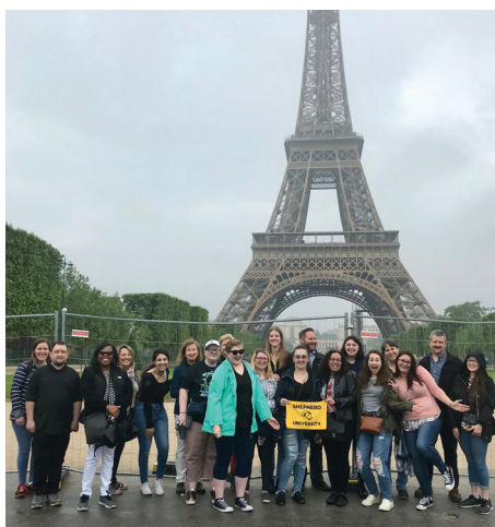
The Department of Psychology sponsored a study tour to England and France in the spring of 2019.