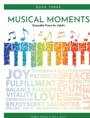
Book Three $28.97 Digital or hard copy