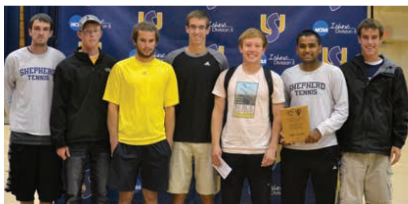
Men's tennis team, highest grade point average award (male team)