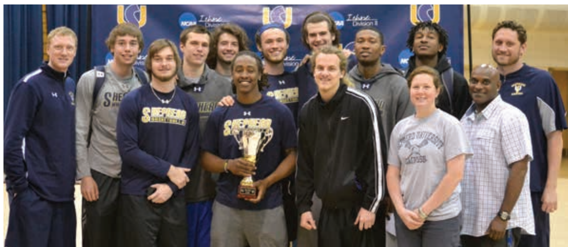
Men's basketball team, Rams Cup award winners